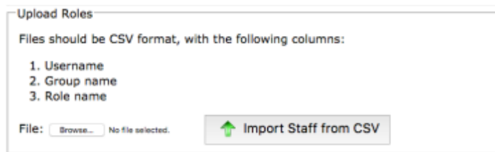
Figure 3: Upload Roles section at bottom of 'Staff' tab, used for bulk upload of staff to supervision groups

Once the file has been created you can use the 'Save As' feature to save the file as CSV or 'Comma Separated Value'. To upload the file use the 'Browse..' button in the 'Upload Roles' section to select the file. The exact selection process will depend on your browser, however once the file has been selected click the 'Import Staff from CSV' button as shown in Figure 3.